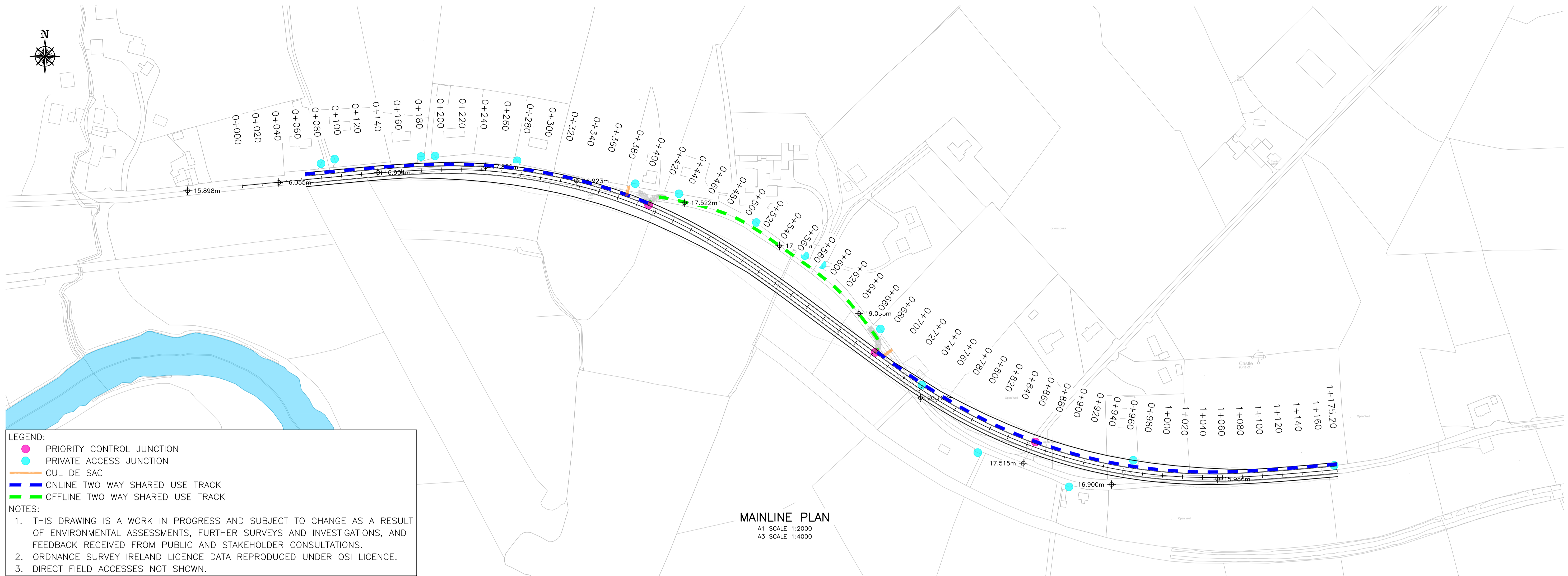
MAINLINE PLAN A1 SCALE 1:2000 A3 SCALE 1:4000