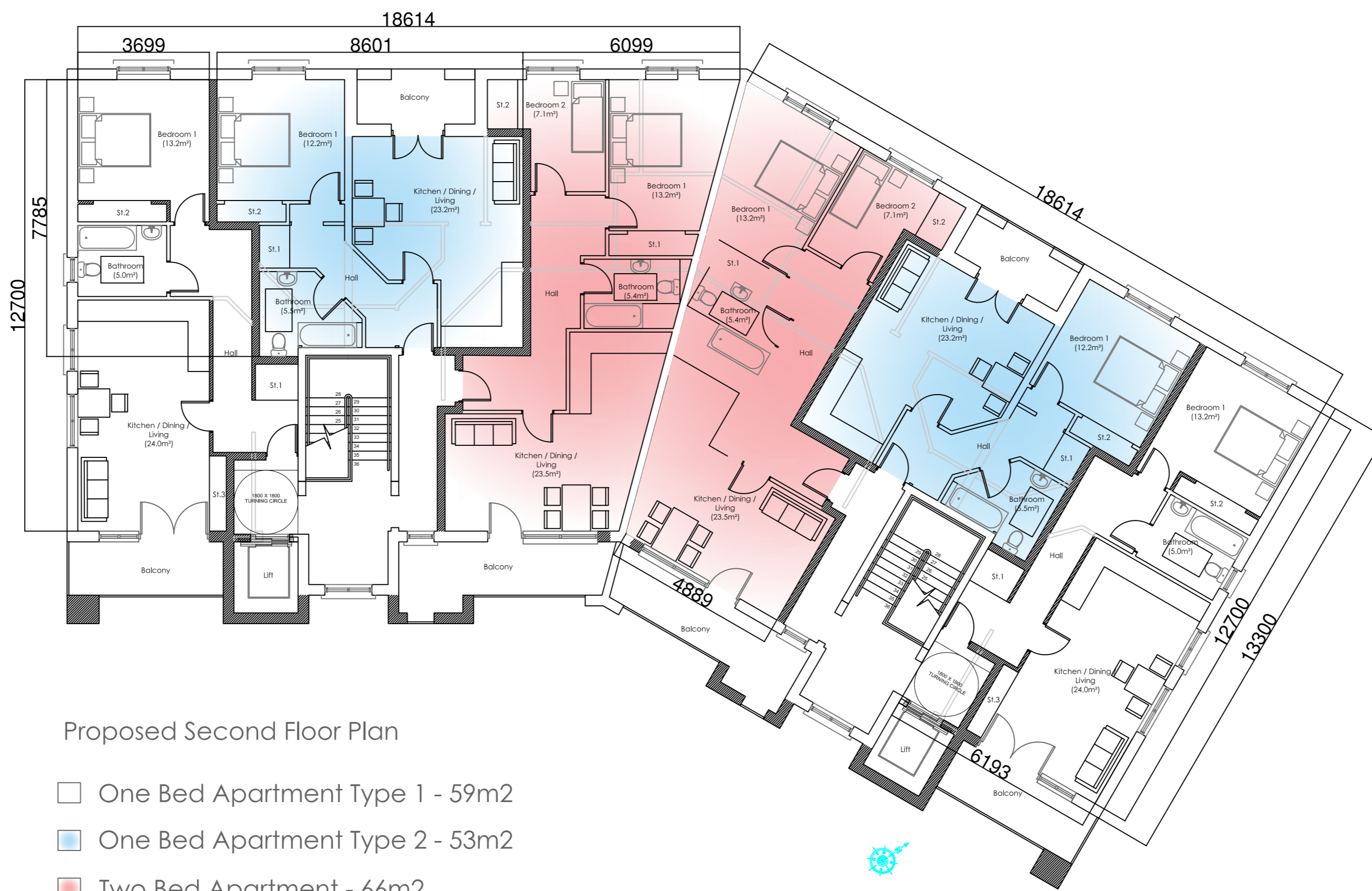
Proposed Second Floor Plan