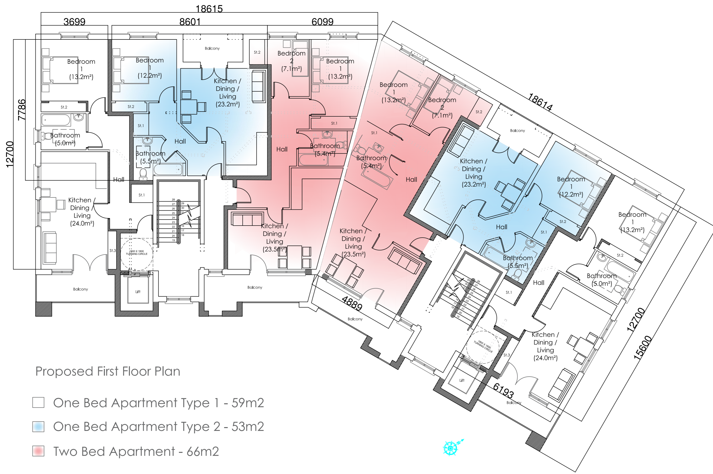
Proposed First Floor Plan