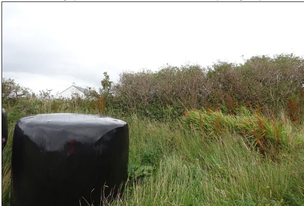
Photograph 1.1: Montbretia in the southeast corner (looking east).